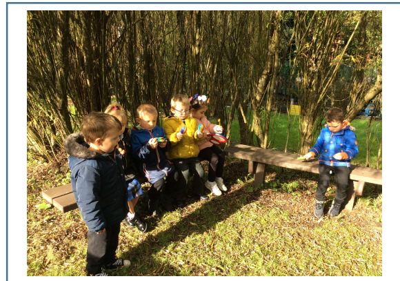
Enjoying a music session outside.