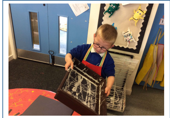
Making spider webs.

Hello Everyone! We hope you have had a lovely break.